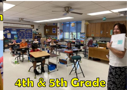
4th & 5th Grade