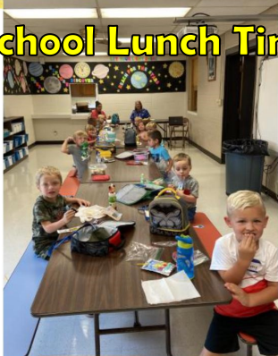
Preschool Lunch Time